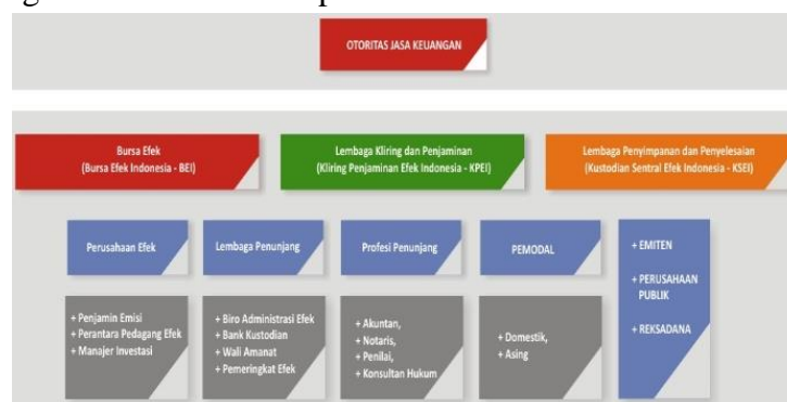
Figure 1 Indonesian Capital Market Structure Chart

According to Arifardhani (2020), the types of capital markets are primary markets and secondary markets. The primary market is the sale of securities by the company that issued the securities before the securities are sold through the stock exchange. Securities are sold at the emission price, so the company issuing the emission only obtains funds from the sale. Emission is the activity of issuing securities (shares) to be offered to the public at an initial price. The secondary market is the sale of securities after sales on the primary market basis have ended. The force of attraction between the supply and demand for securities determines how much they cost. An outline of the institutions connected to the Indonesian capital market is provided below.