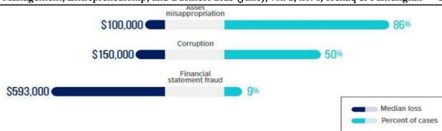
Figure 1. Percentage of Fraud in 2022